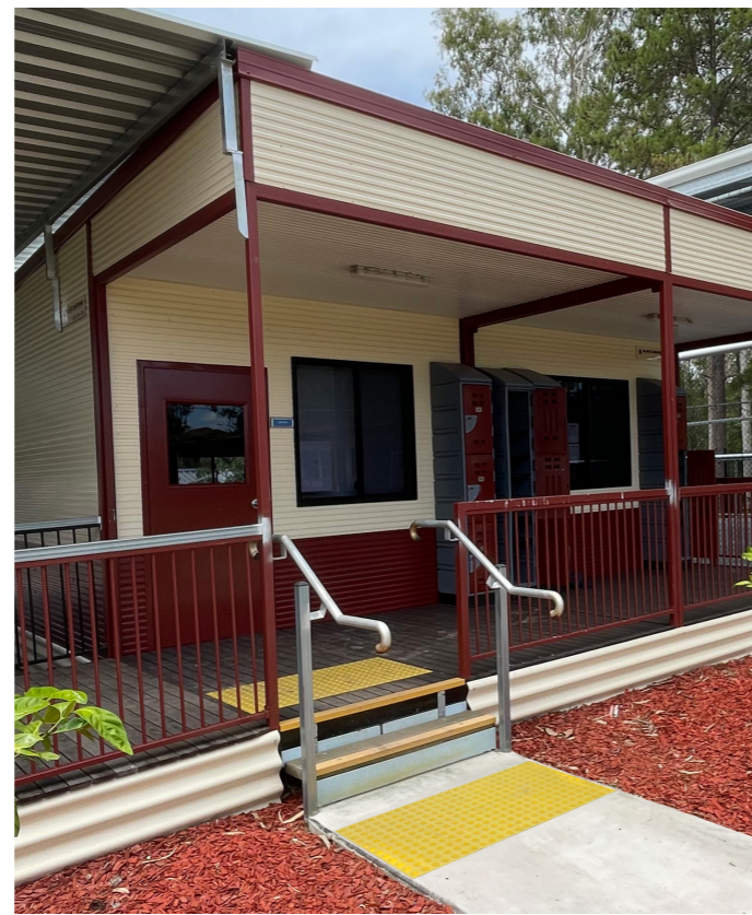
LEFT: St Francis of Assisi Regional Catholic Primary School RIGHT: Wisdom College