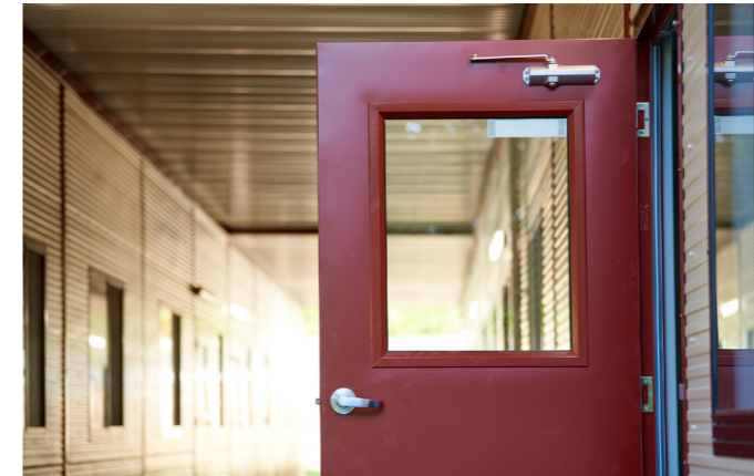
Doors fitted with viewing panel.