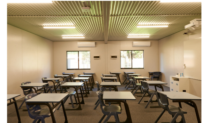
Internal view of classroom with carpet and acoustic ceilings.