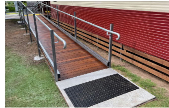
External view with access ramps.

For broader school community needs, we deliver libraries, outside school care spaces, and early childhood facilities such as daycare, kindergartens, and early learning centres each designed with quality, functionality, and flexibility in mind.