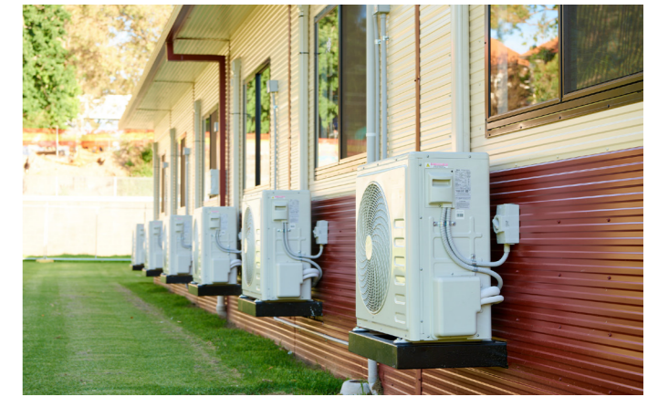
Reverse Cycle air conditioning.