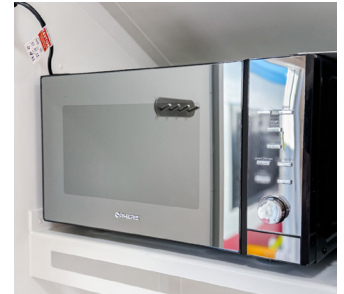
TOP: Hot/ cold filtered water tap BOTTOM: Included appliances