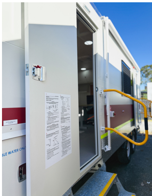
BOTTOM LEFT Safety Handrails and Steps