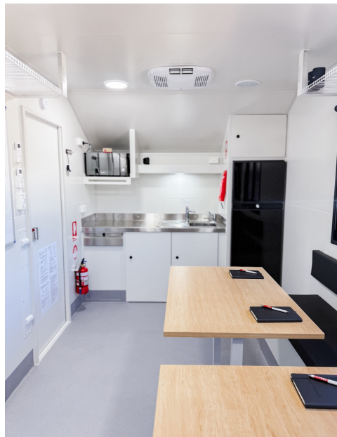
Interior view showing kitchenette