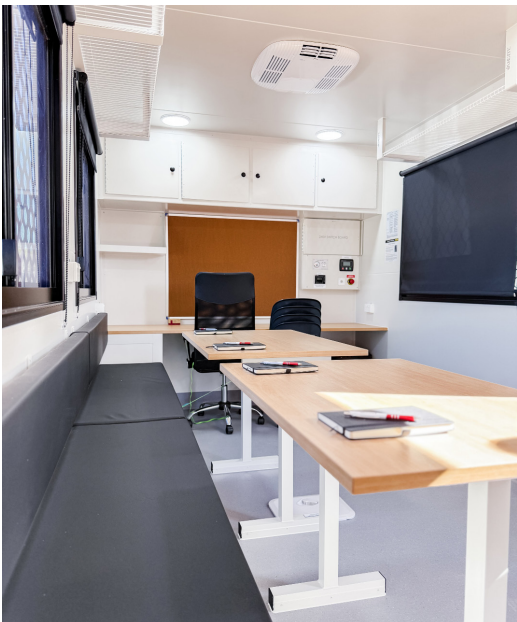
Interior view showing office space with desks and seating