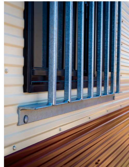
LEFT: External view of single building RIGHT: External view showing galvanised security bars